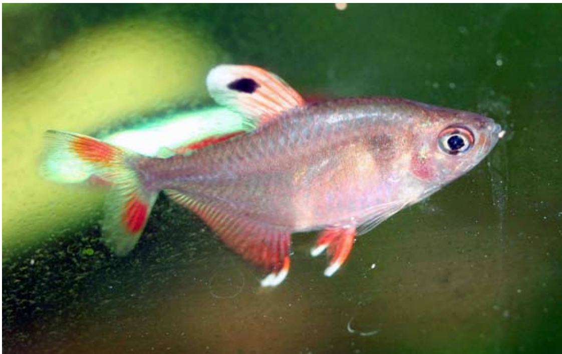
Serpae Tetra.