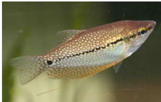
Opaline Gourami