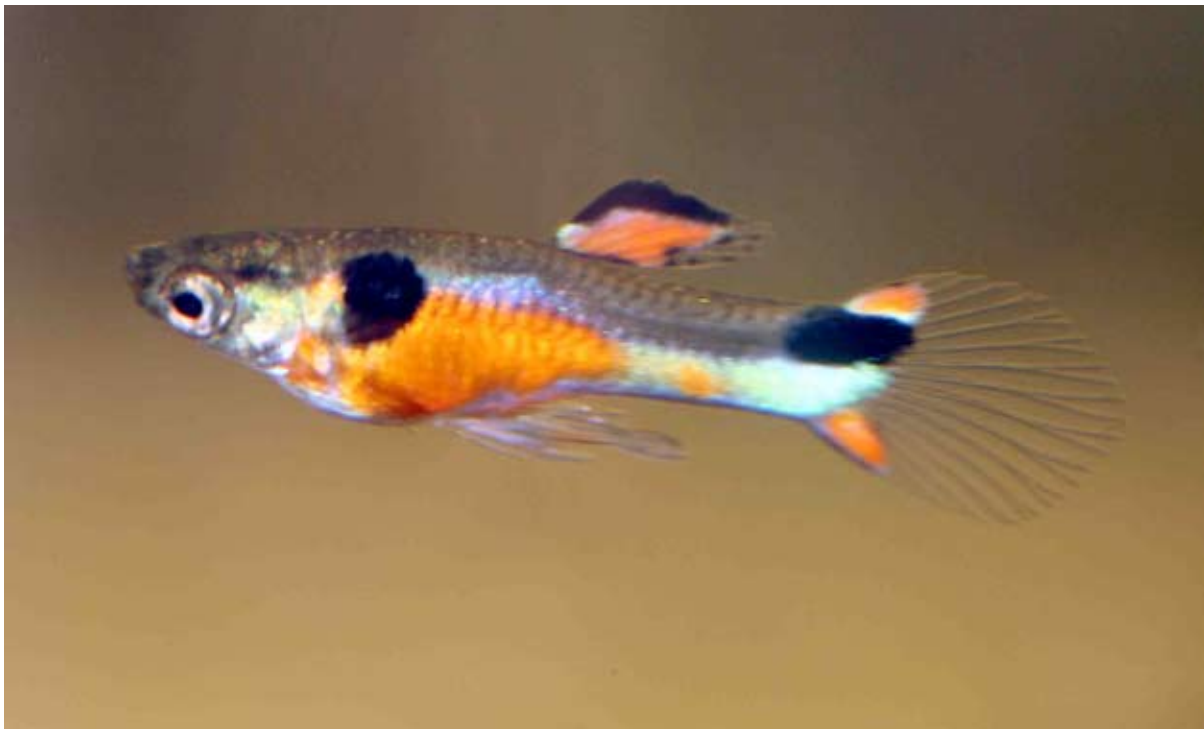
Endler's Livebearer.

Obviously small fish and fry need more frequent feeding and should not go for more than one day without food, while healthy adult fish can go for several days without feeding if you should go away for a long weekend. If you plan to be away for longer periods automatic feeders are a good idea, but they are expensive. Holiday feeding blocks are an excellent alternative, they dissolve slowly releasing food into the aquarium. Asking a neighbor or friend is another option but make sure you spend time explaining your feeding program and write down some instructions, also it is a good idea to wrap individual feedings so that your neighbor can't over feed.