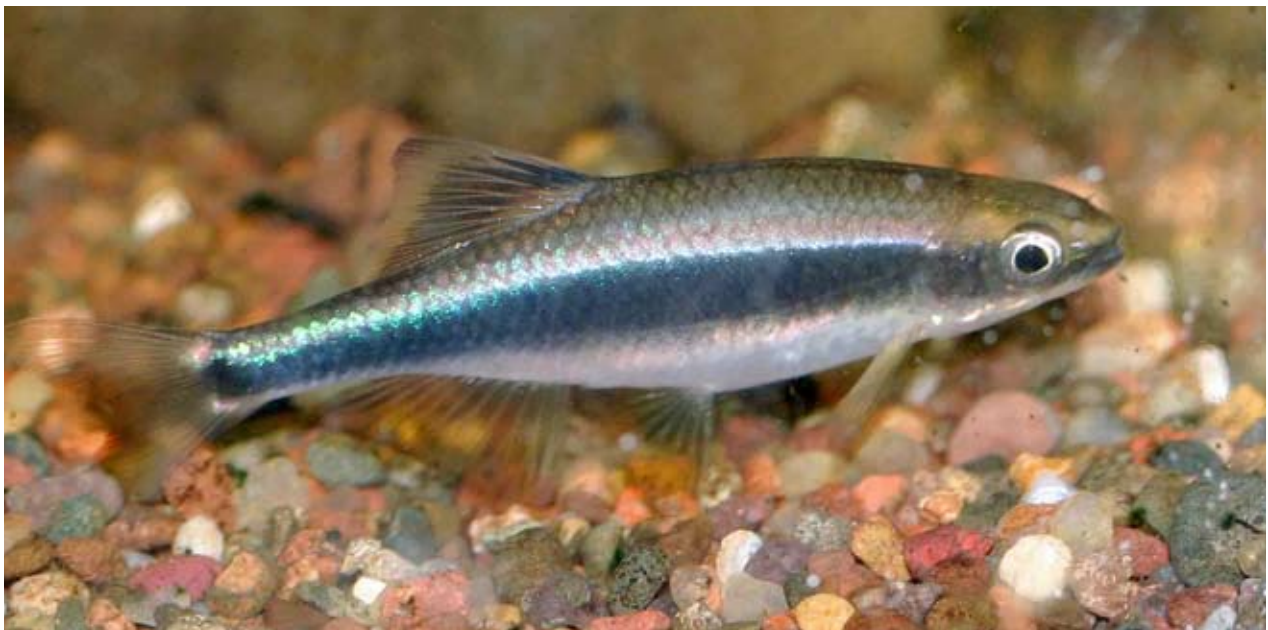
Metallic Flagfin Shiner

Sterba, Gunther. 1966. Freshwater Fishes of the World. The Pet Library Ltd. English Translation